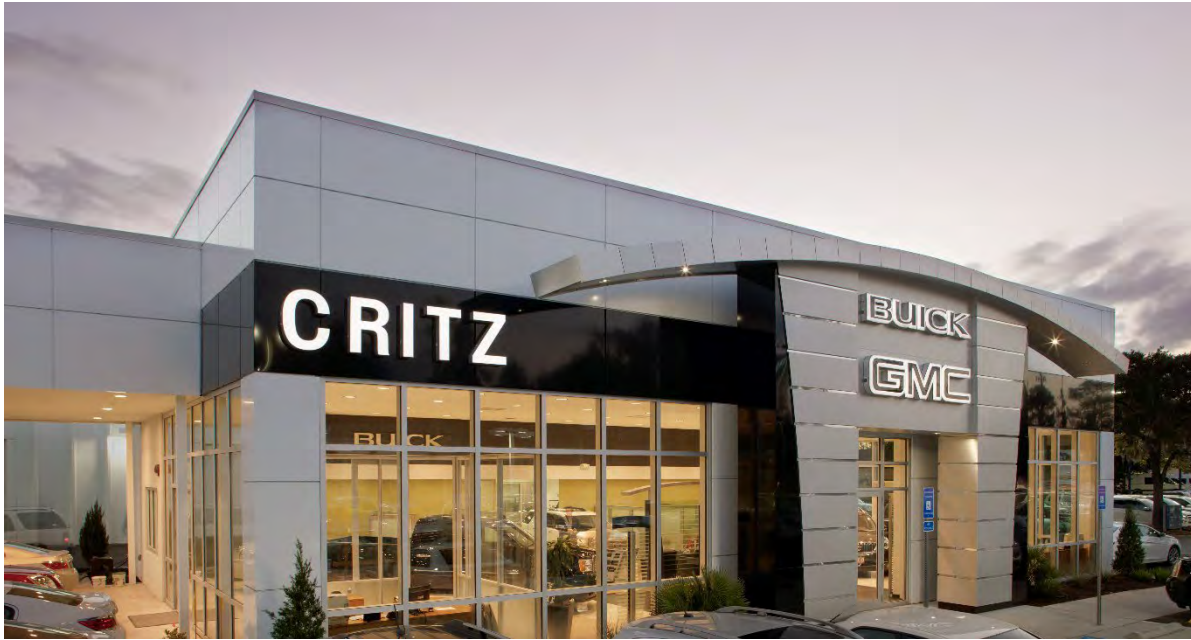
Critz Buick-GMC Dealership Savannah, GA Size: 4,500 SF Role: Architect & Engineer of Record