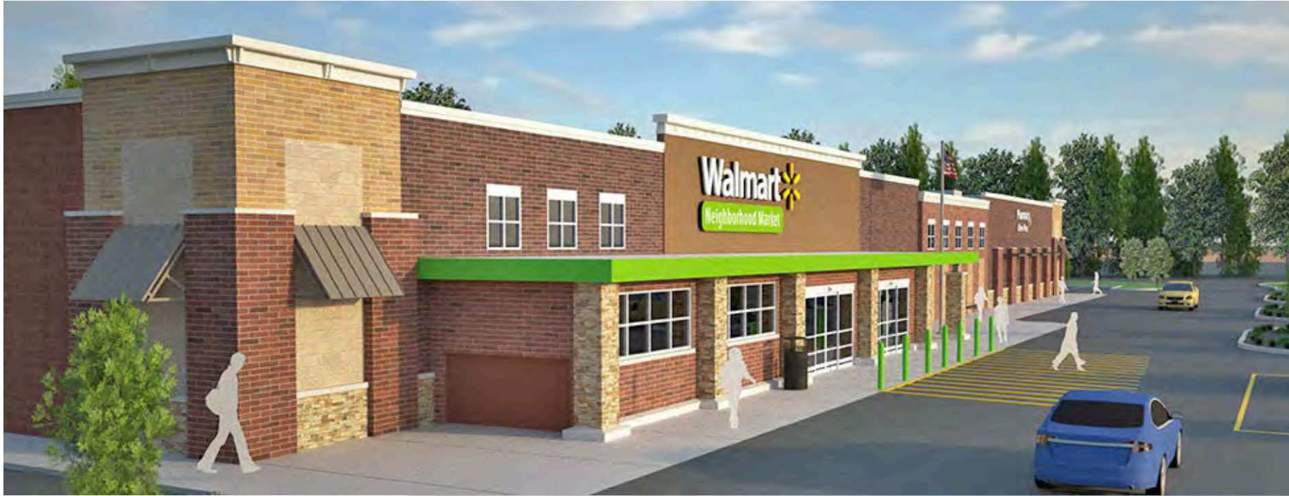
Walmart at Fort Mill Square Fort Mill, SC Role: Civil Engineering & Site Development