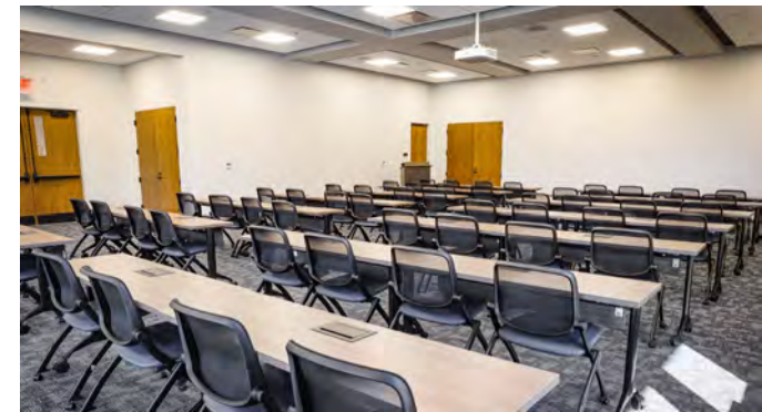
Effingham County Industrial Authority's New Headquarters, Rincon, GA Size: 30,000 SF Role: Architect & Engineer of Record