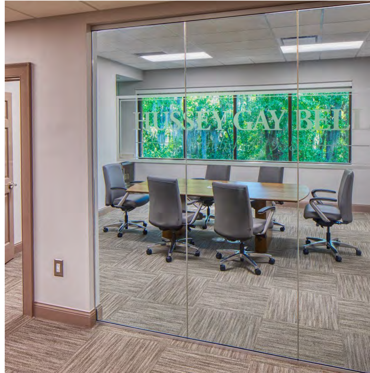
Hussey Gay Bell HQ Renovation Savannah, GA Size: 30,000 SF Role: Architect & Engineer of Record