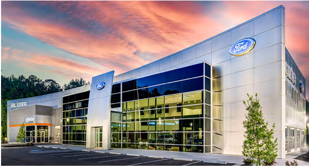
J.C. Lewis Ford Dealership & Quick Lane Service Center, Pooler, GA Size: 54,500 SF Role: Architect & Engineer of Record