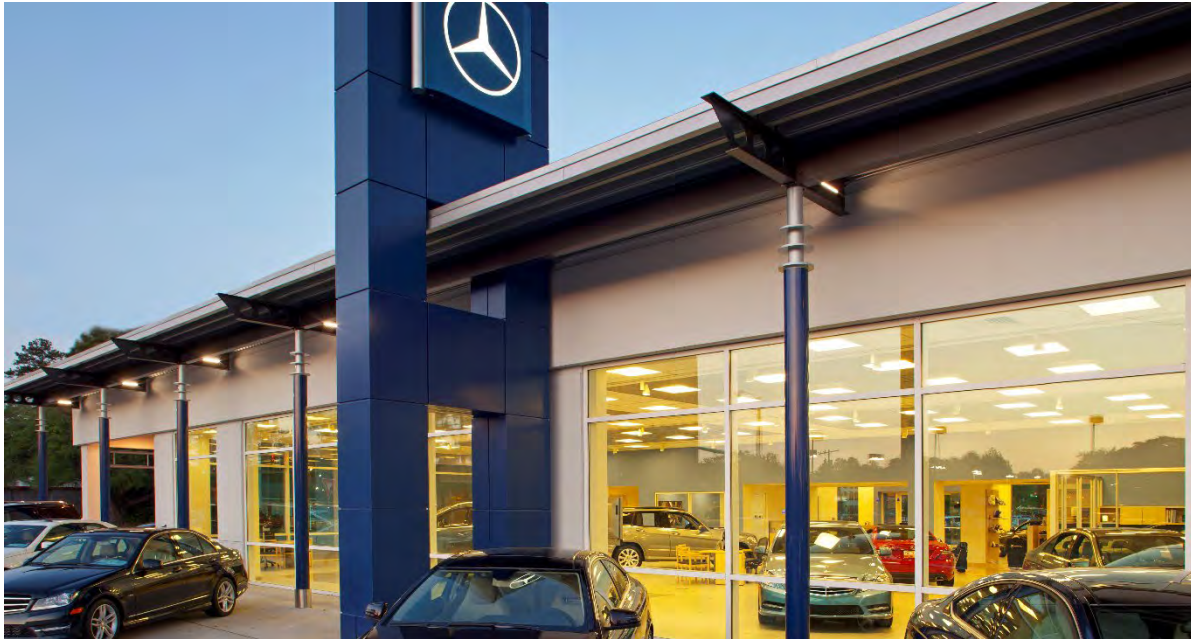
Critz Mercedes Benz Dealership Savannah, GA Size: 9,000 SF Role: Architect & Engineer of Record