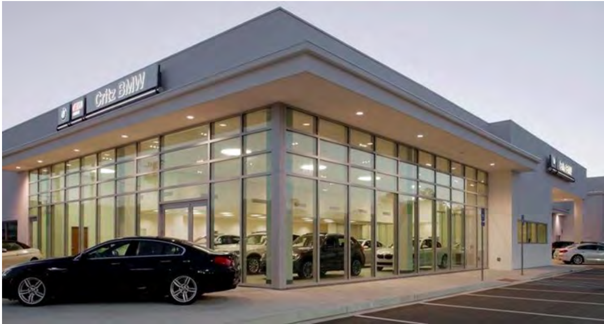
Critz BMW Dealership Savannah, GA Size: 34,700 SF Role: Architect & Engineer of Record