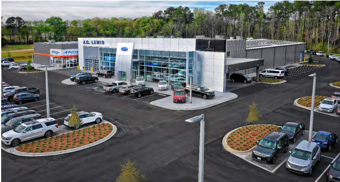
J.C. Lewis Ford Dealership & Service Center Statesboro, GA Size: 30,900 SF Role: Architect & Engineer of Record