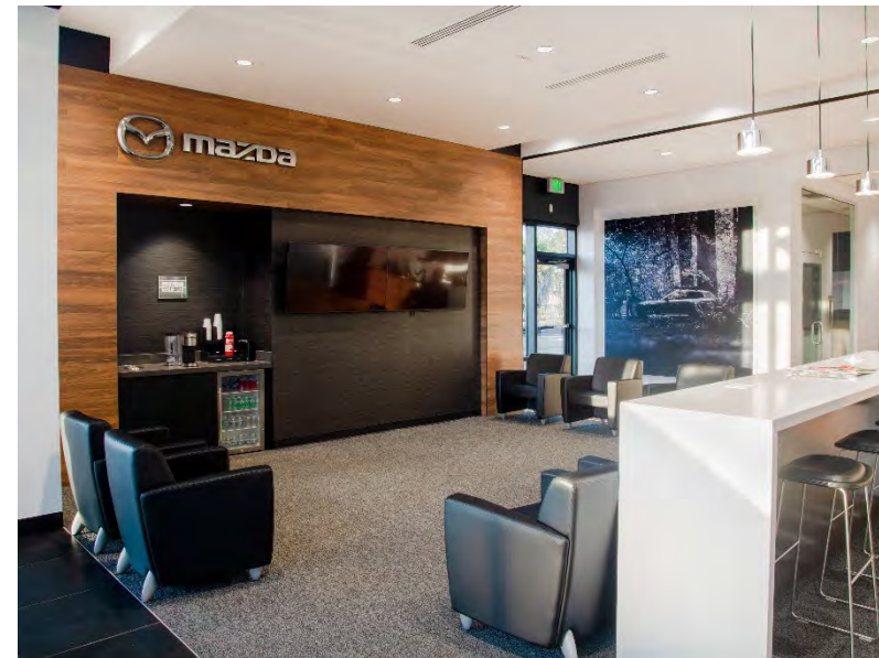
J.C. Lewis Mazda Dealership Savannah, GA Size: 2,900 SF Role: Architect & Engineer of Record