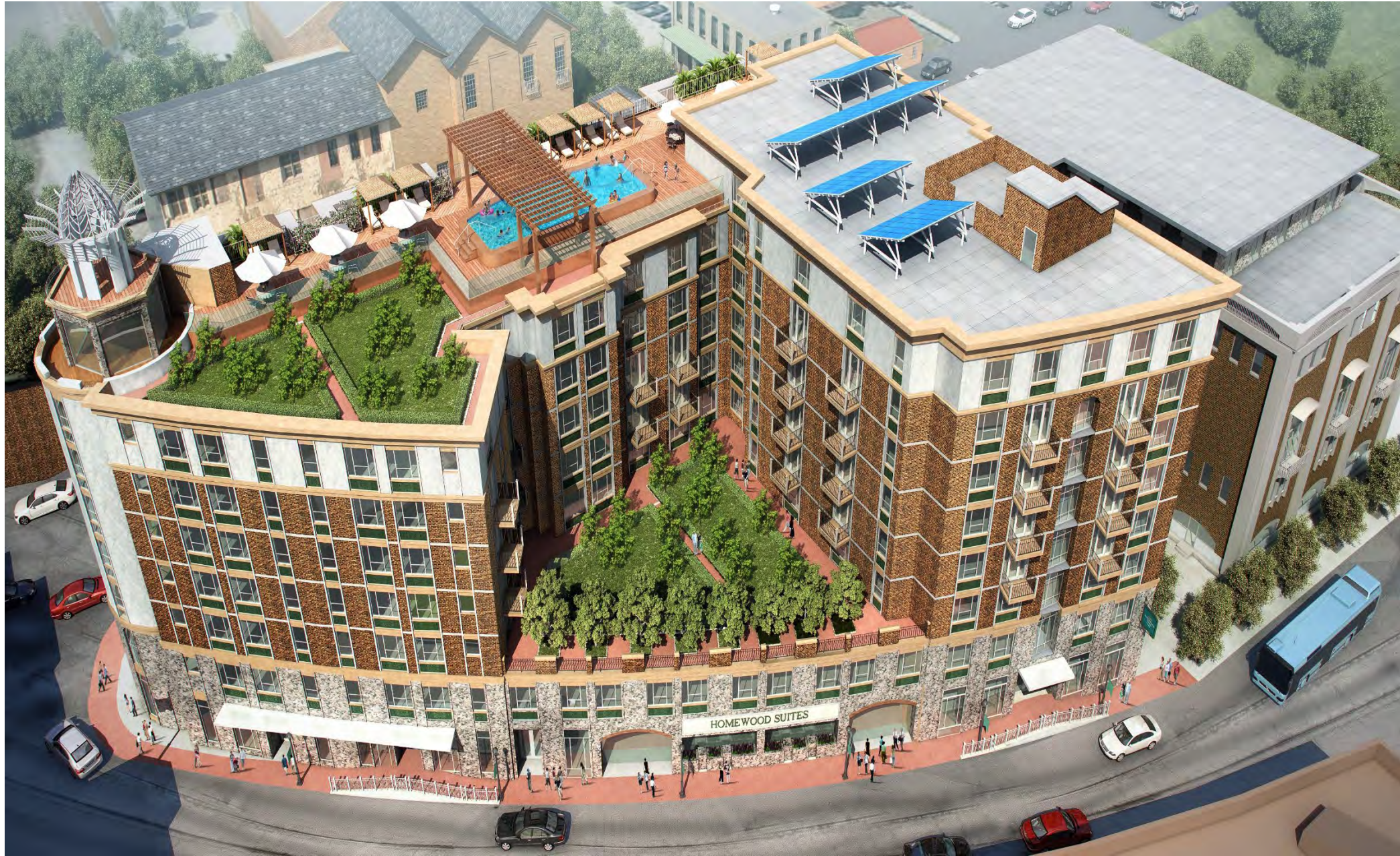
Homewood Suites by Hilton Savannah, GA Size: 162 units Role: Civil Engineering & Site Development