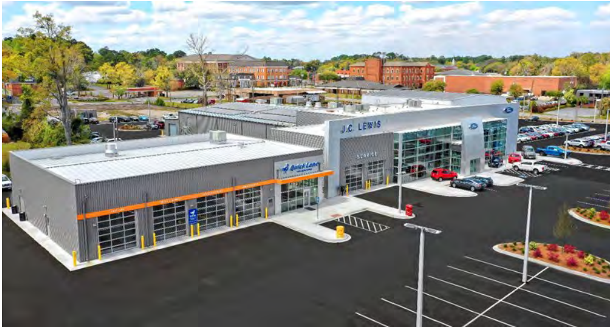
J.C. Lewis Ford Dealership & Service Center Hinesville, GA Size: 33,700 SF Role: Architect & Engineer of Record