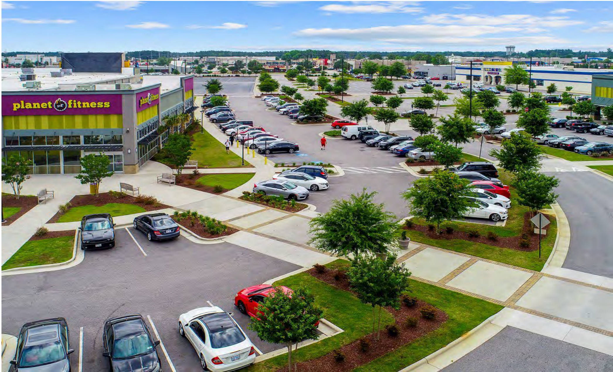
Marketfair Mall Fayetteville, NC Role: Civil Engineering & Site Development