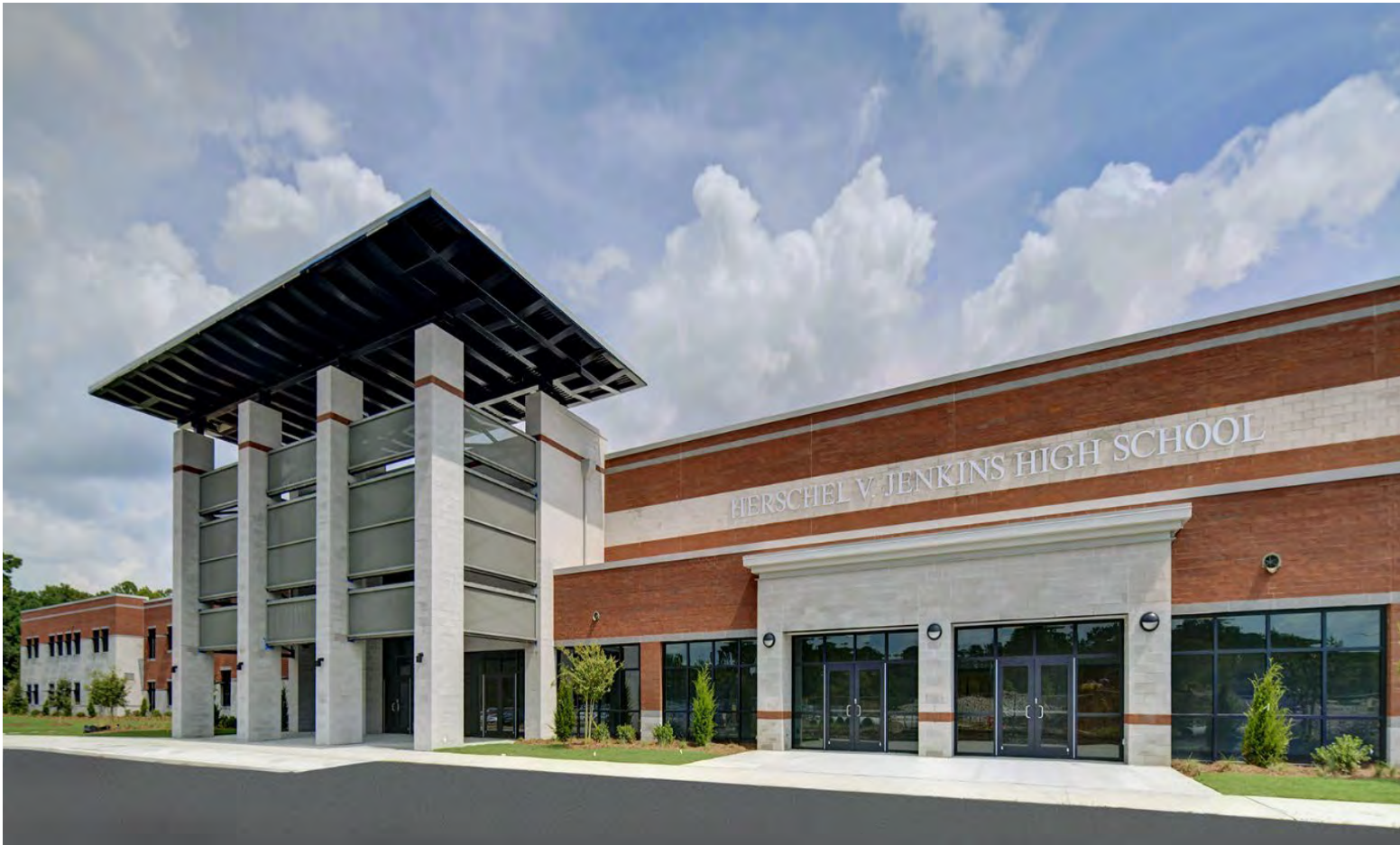
Herschel V. Jenkins High School Savannah-Chatham County Public School System Savannah, GA

Completion Date: 2022 Size: 241,651 SF Construction Cost: $58M Services: Architecture, Interiors, Civil, Structural, Surveying