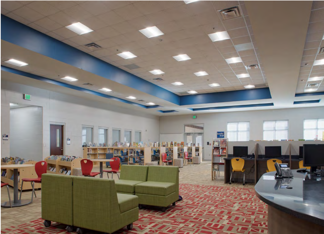
Humanities at Juliette Gordon Low Elementary School Savannah-Chatham County Public School System Savannah, GA

Completion Date: 2017 Size: 127,855 SF Construction Cost: $24.1M Services: Architecture, Interiors, Civil & Structural