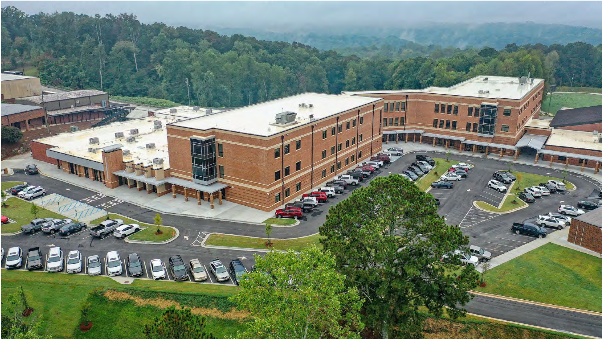
East Hall High School Expansion & Renovation Hall County School District Hall County, GA

Completion Date: 2024 Size: 125,000 SF Construction Cost: $32M Services: Architecture, Interiors & Civil