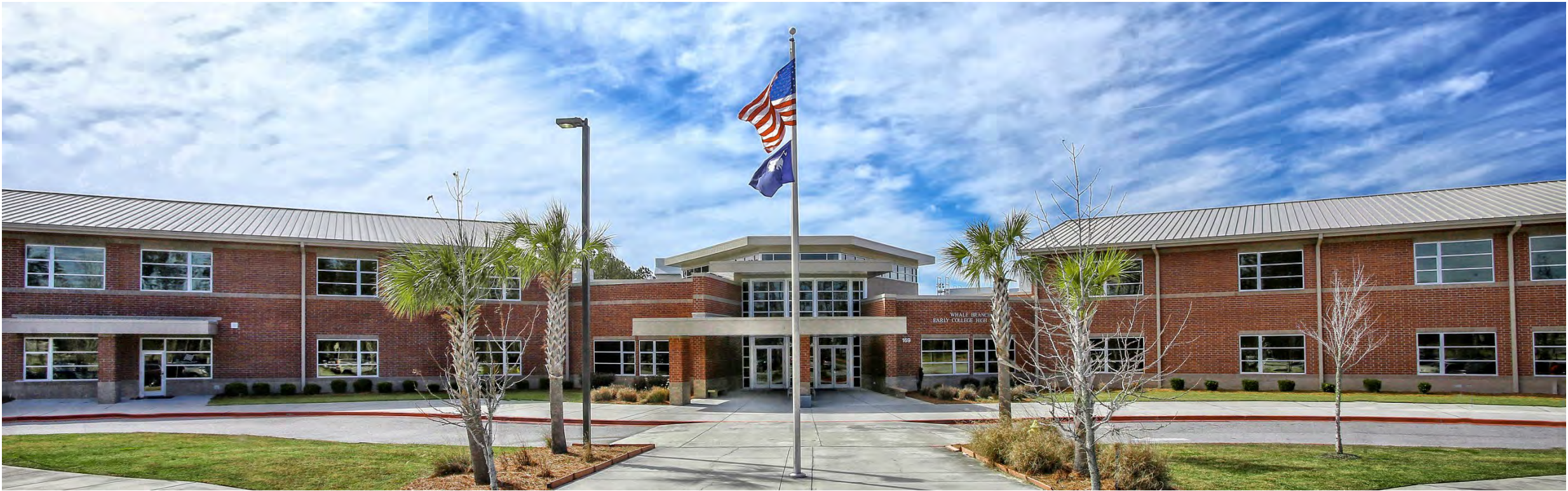
Whale Branch Early College High School Beaufort County School District Seabrook, SC

Completion Date: 2010 Size: 180,000 SF Construction Cost: $28.7M Services: Architecture