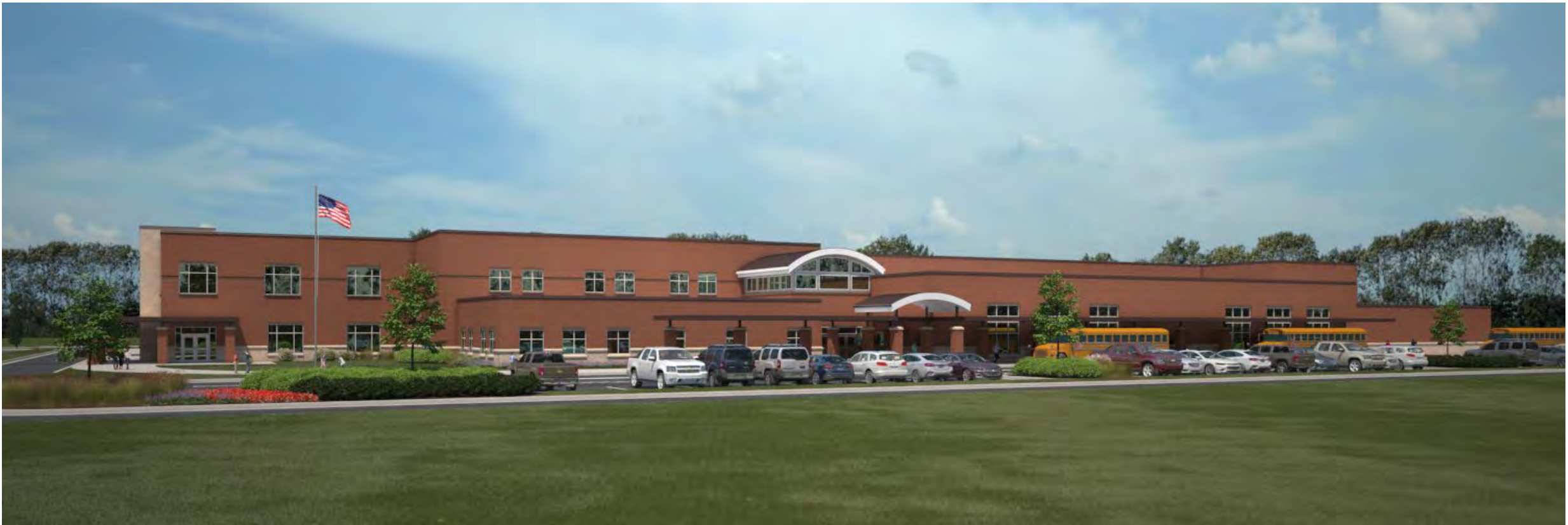
Meadowcreek Cluster Elementary School Gwinnett County Public Schools Tucker, GA

Completion Date: 2018 Size: 207,616 SF Construction Cost: $31M Services: Architecture & Interiors