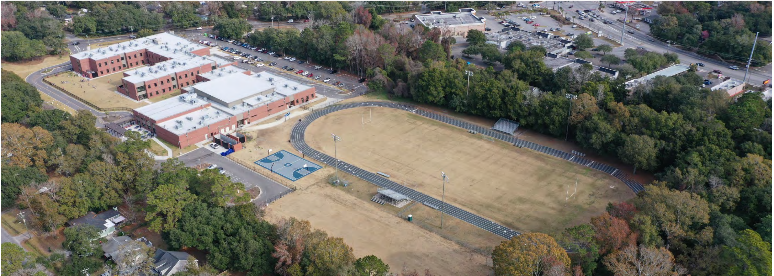
Camp Road Middle School Charleston County School District Charleston, SC

Completion Date: 2020 Size: 137,000 SF Construction Cost: $52M Services: Civil Engineering