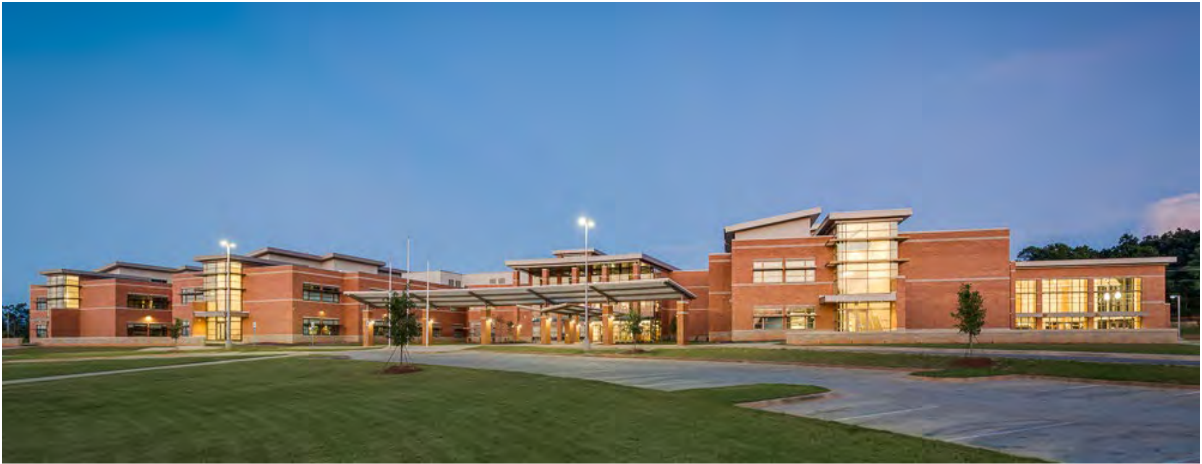
Meadow Glen Middle School Lexington County School District One Lexington County, SC

Completion Date: 2012 Size: 180,000 SF Construction Cost: $30.6M Services: Architecture, Interiors & Civil