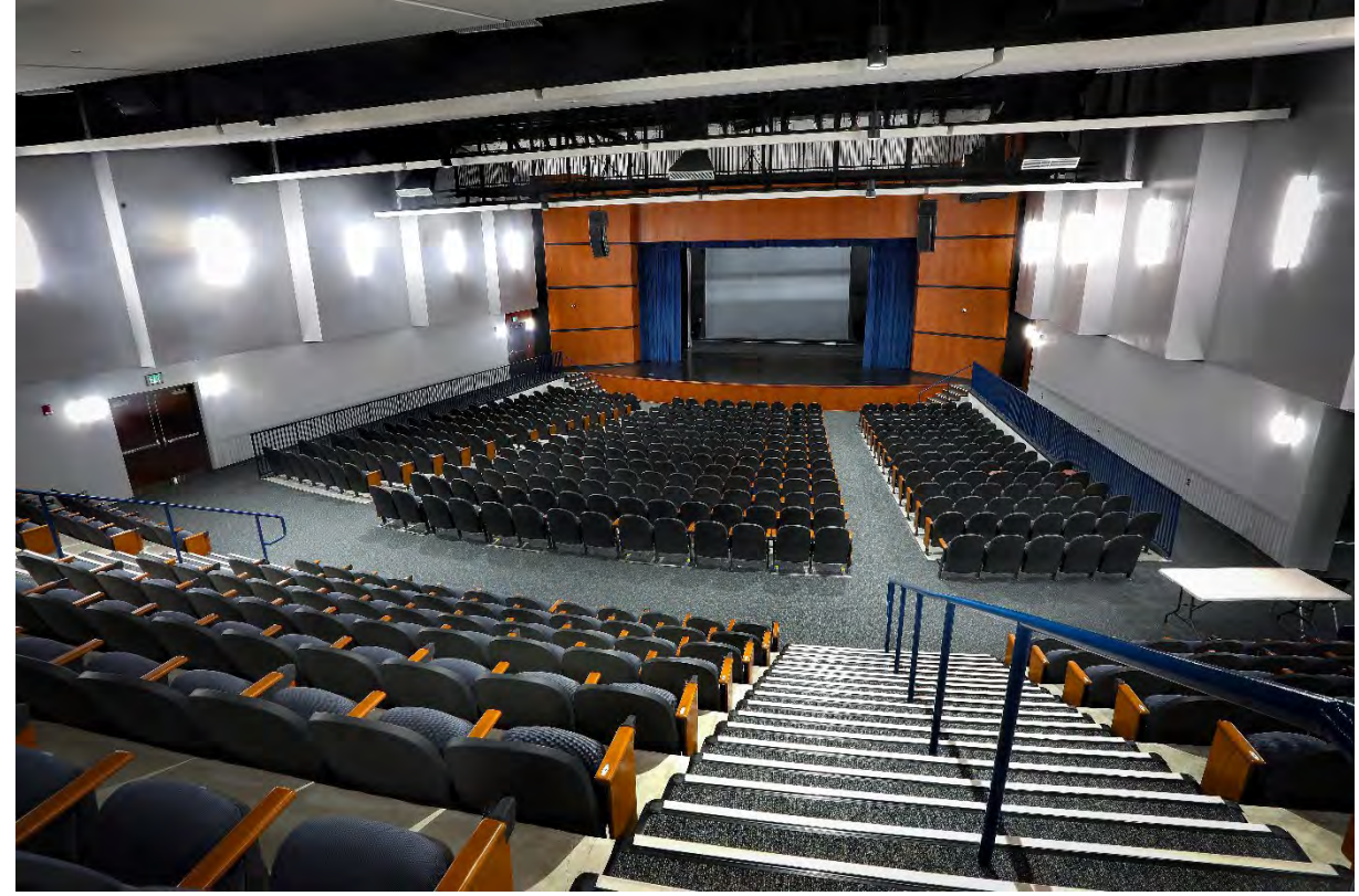
Cedar Grove High School Auditorium DeKalb County School District Ellenwood, GA

Completion Date: 2023 Size: 21,800 SF Construction Cost: $11M Services: Architecture & Interiors