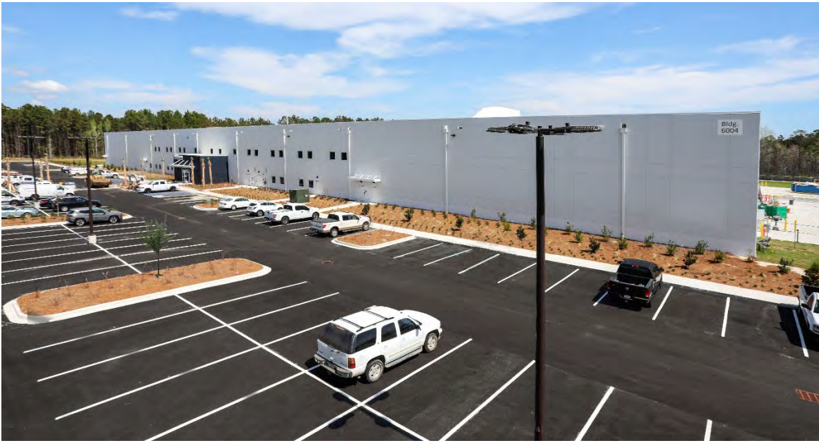
Gulfstream Wing Assembly Building Savannah, GA