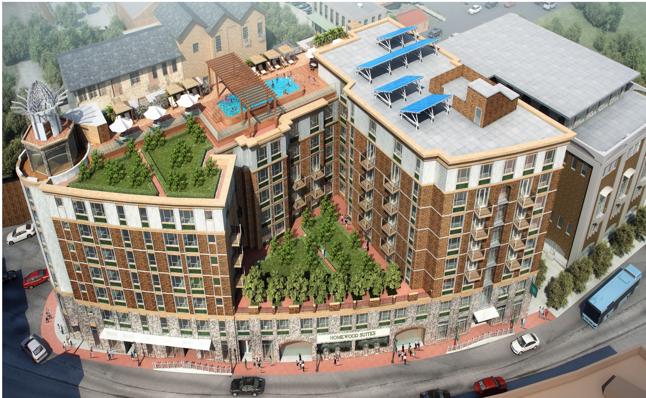
Homewood Suites by Hilton Savannah, GA Size: 162 units Role: Civil Engineering & Site Development