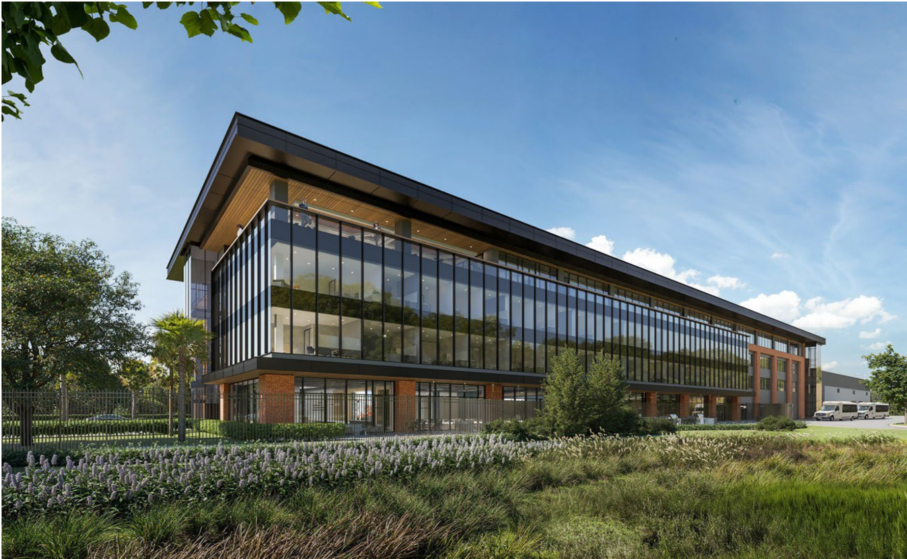
Georgia Ports Authority's Maintenance, Operations & Administration Complex, Garden City Terminal, GA