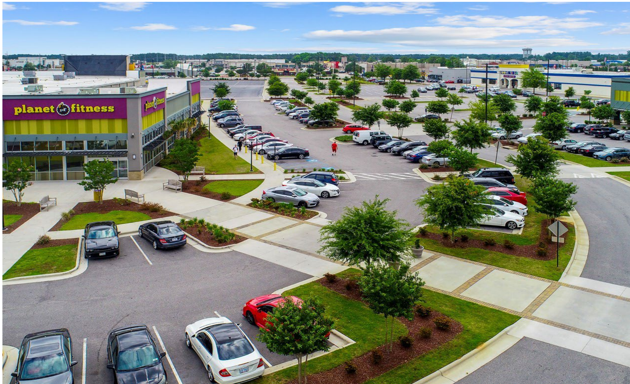
Marketfair Mall Fayetteville, NC Role: Civil Engineering & Site Development