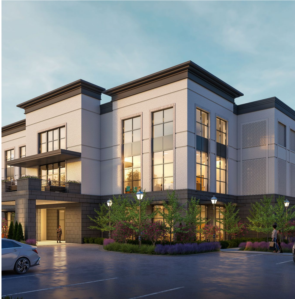
Effingham County Industrial Authority's New Headquarters, Rincon, GA Size: 30,000 SF Role: Architect & Engineer of Record