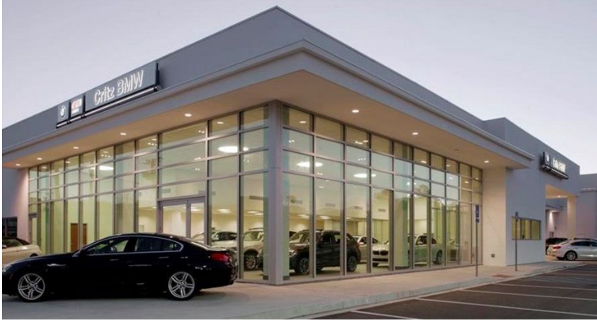
Critz BMW Dealership Savannah, GA Size: 34,700 SF Role: Architect & Engineer of Record