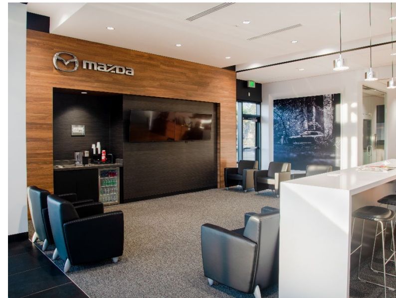
J.C. Lewis Mazda Dealership Savannah, GA Size: 2,900 SF Role: Architect & Engineer of Record