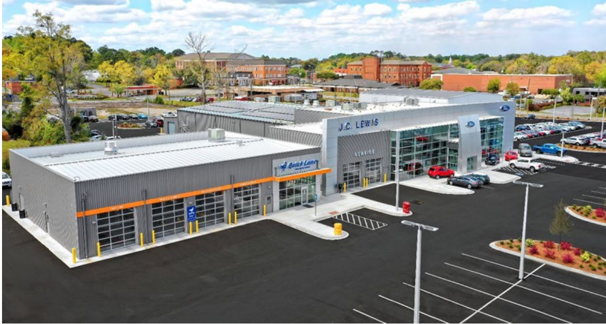
J.C. Lewis Ford Dealership & Service Center Hinesville, GA Size: 33,700 SF Role: Architect & Engineer of Record