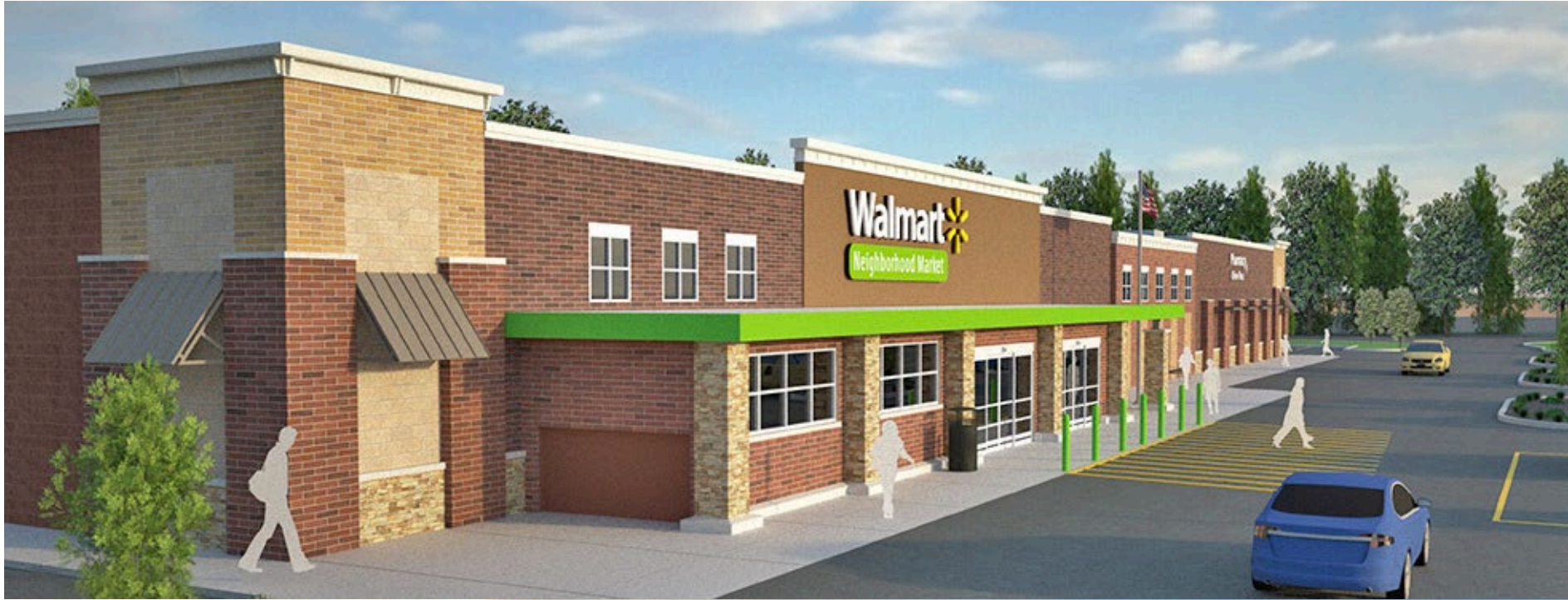
Walmart at Fort Mill Square Fort Mill, SC Role: Civil Engineering & Site Development