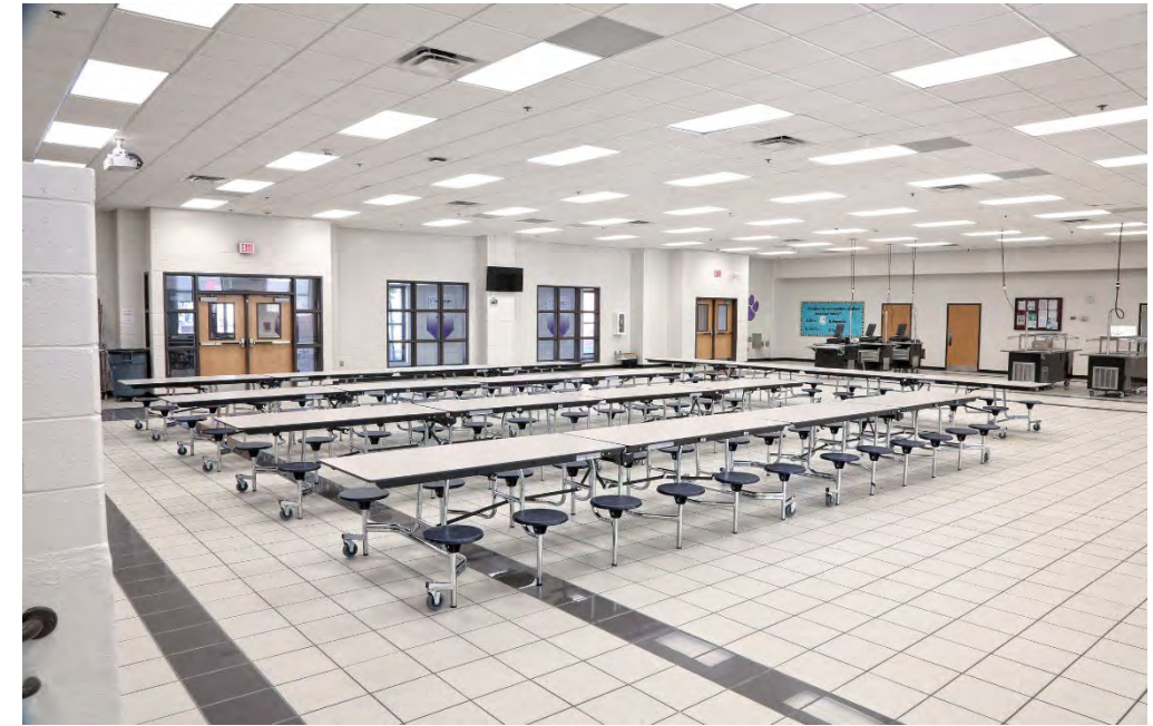
Coleman STEAM Middle School Renovation Gwinnett County Public Schools Duluth, GA

Completion Date: 2018 Size: 123,200 SF Construction Cost: $5.1M (renovations); $2.4M (roof & HVAC renovation) Services: Architecture & Interiors