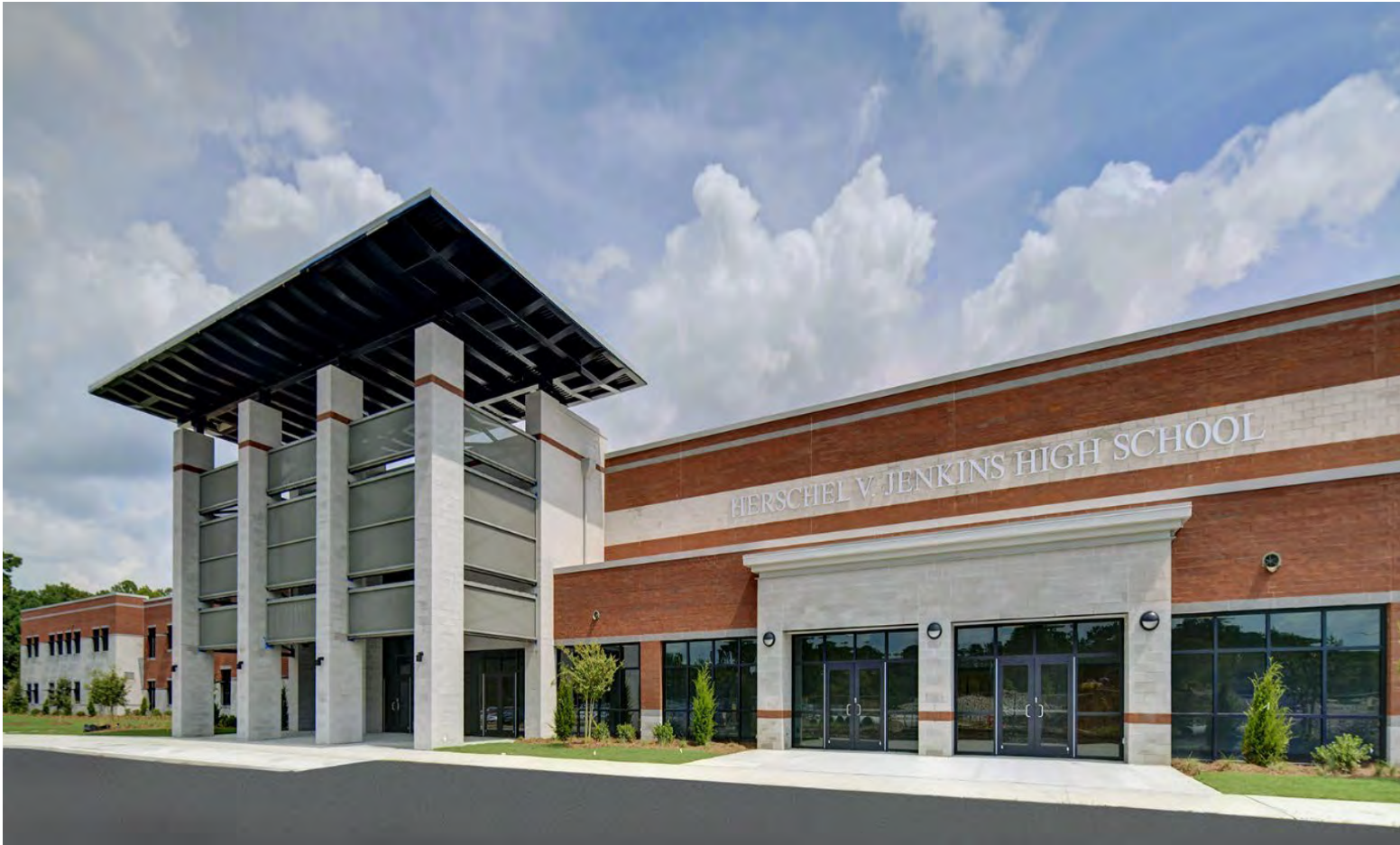
Herschel V. Jenkins High School Savannah-Chatham County Public School System Savannah, GA

Completion Date: 2022 Size: 241,651 SF Construction Cost: $58M Services: Architecture, Interiors, Civil, Structural, Surveying