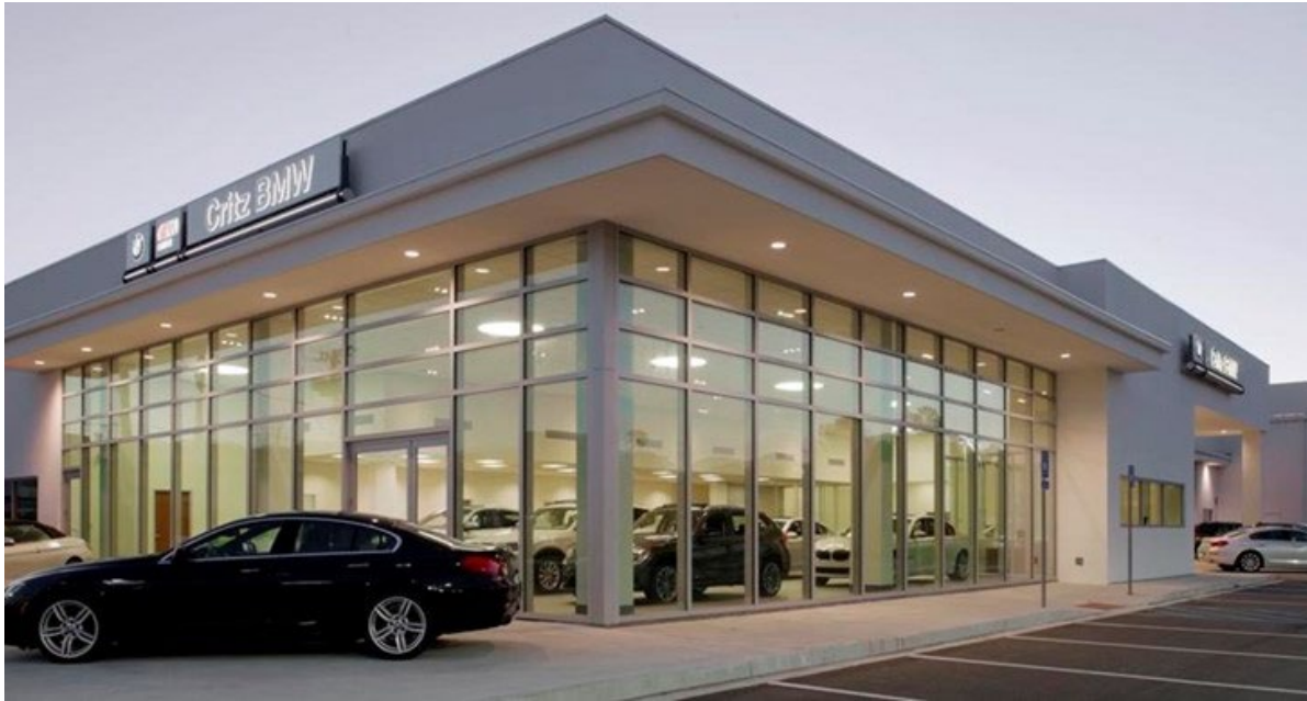
Critz BMW Dealership Savannah, GA Size: 34,700 SF Role: Architect & Engineer of Record