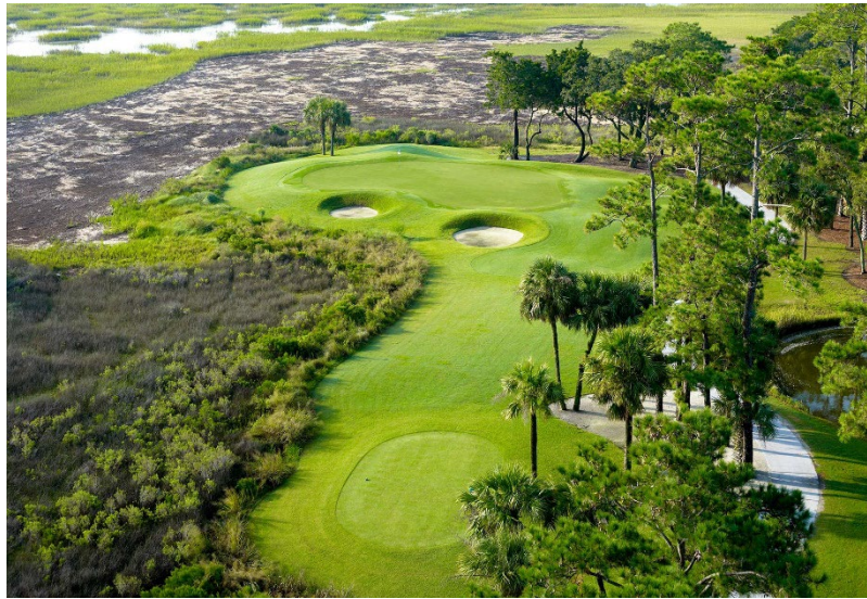
The Landings, Phase II Skidaway Island, Chatham County, GA Size: 6,300 Acres Role: Civil Design Improvements