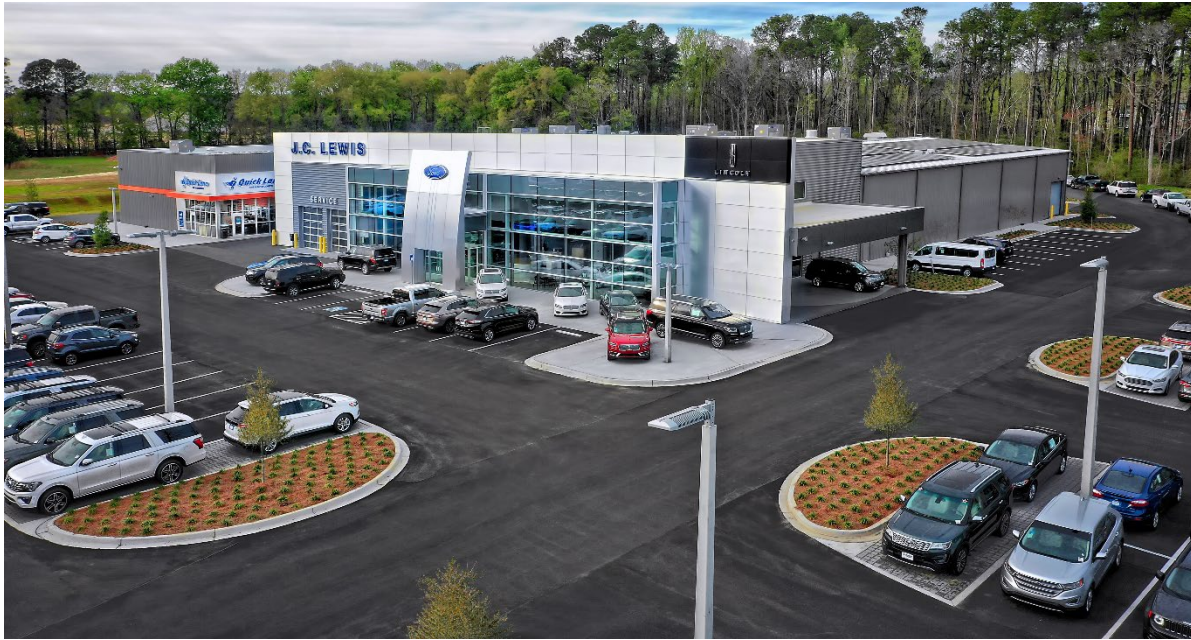
J.C. Lewis Ford Dealership & Service Center Statesboro, GA Size: 30,900 SF Role: Architect & Engineer of Record