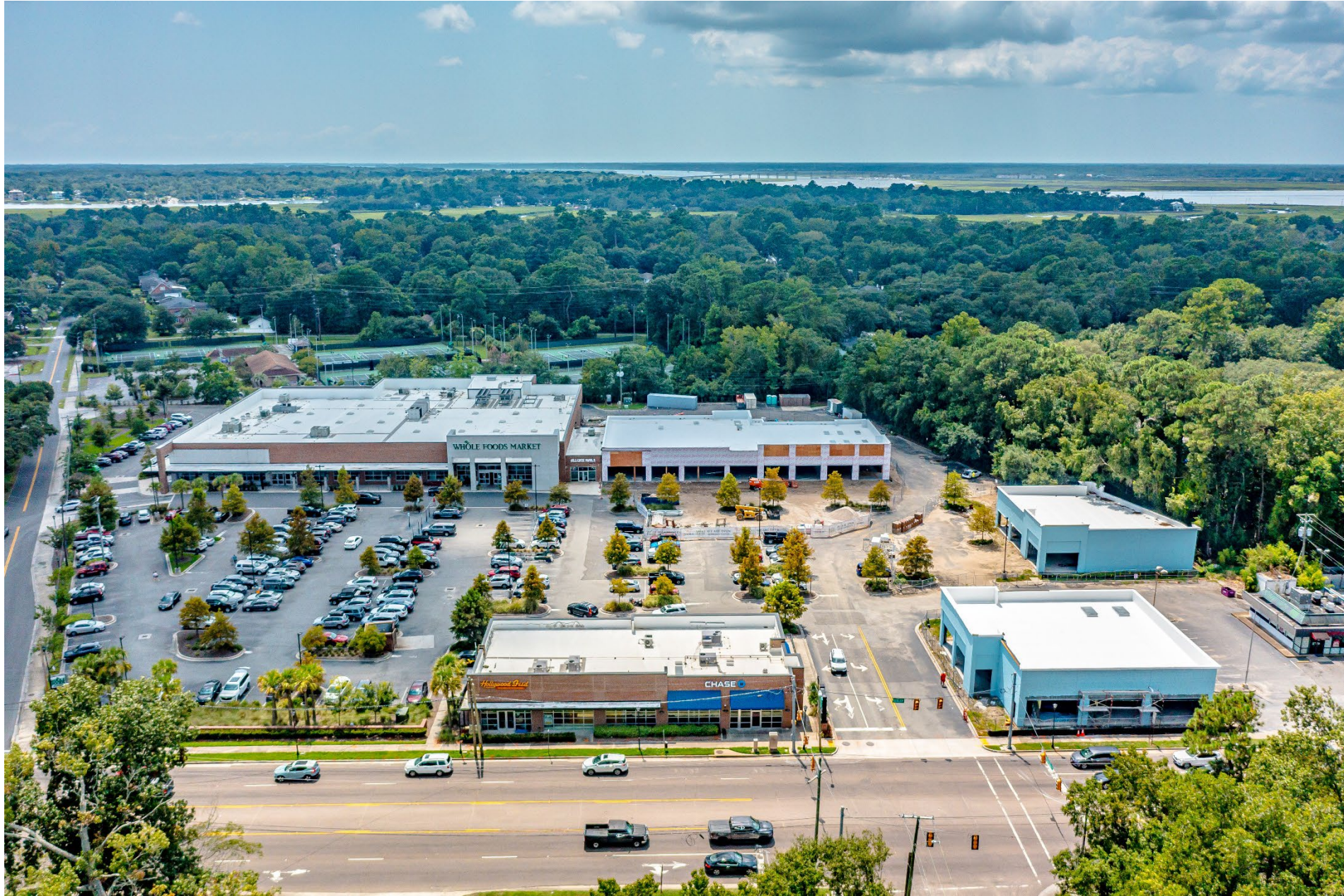
Whole Foods Market West Ashley Charleston, SC Role: Civil Engineering & Site Development