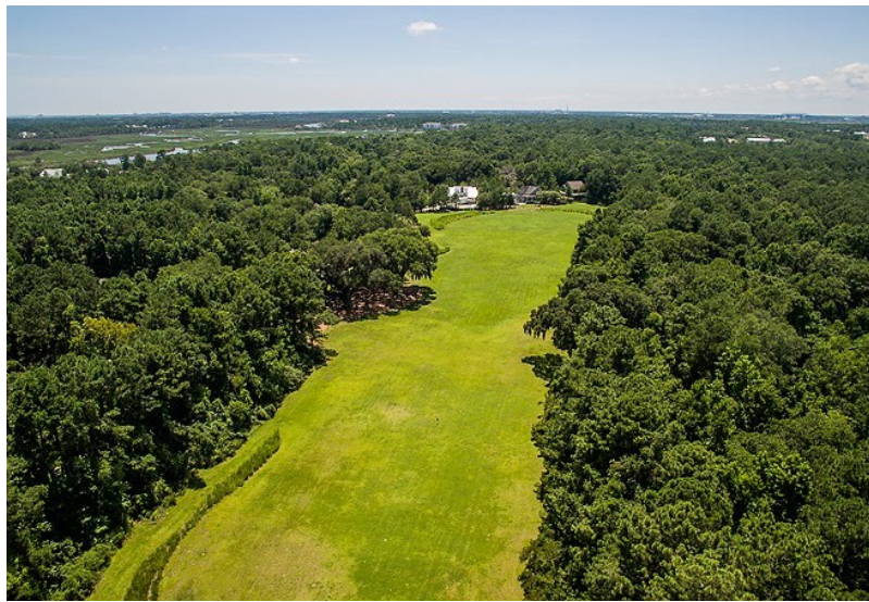
Beresford Hall Assembly Charleston, SC Size: 950 Acres Role: Master Planning, Civil Engineering & Site Development