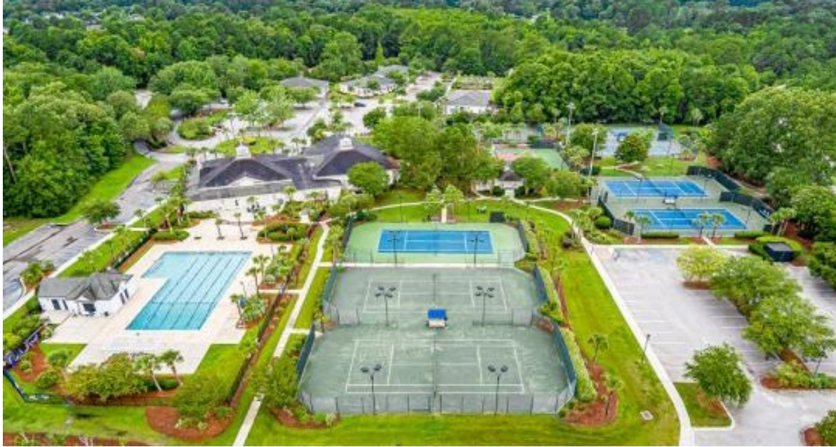
Dunes West PUD, Charleston County, SC Size: 4,500-Acre PUD Role: Master Planning, Civil Engineering & Site Development