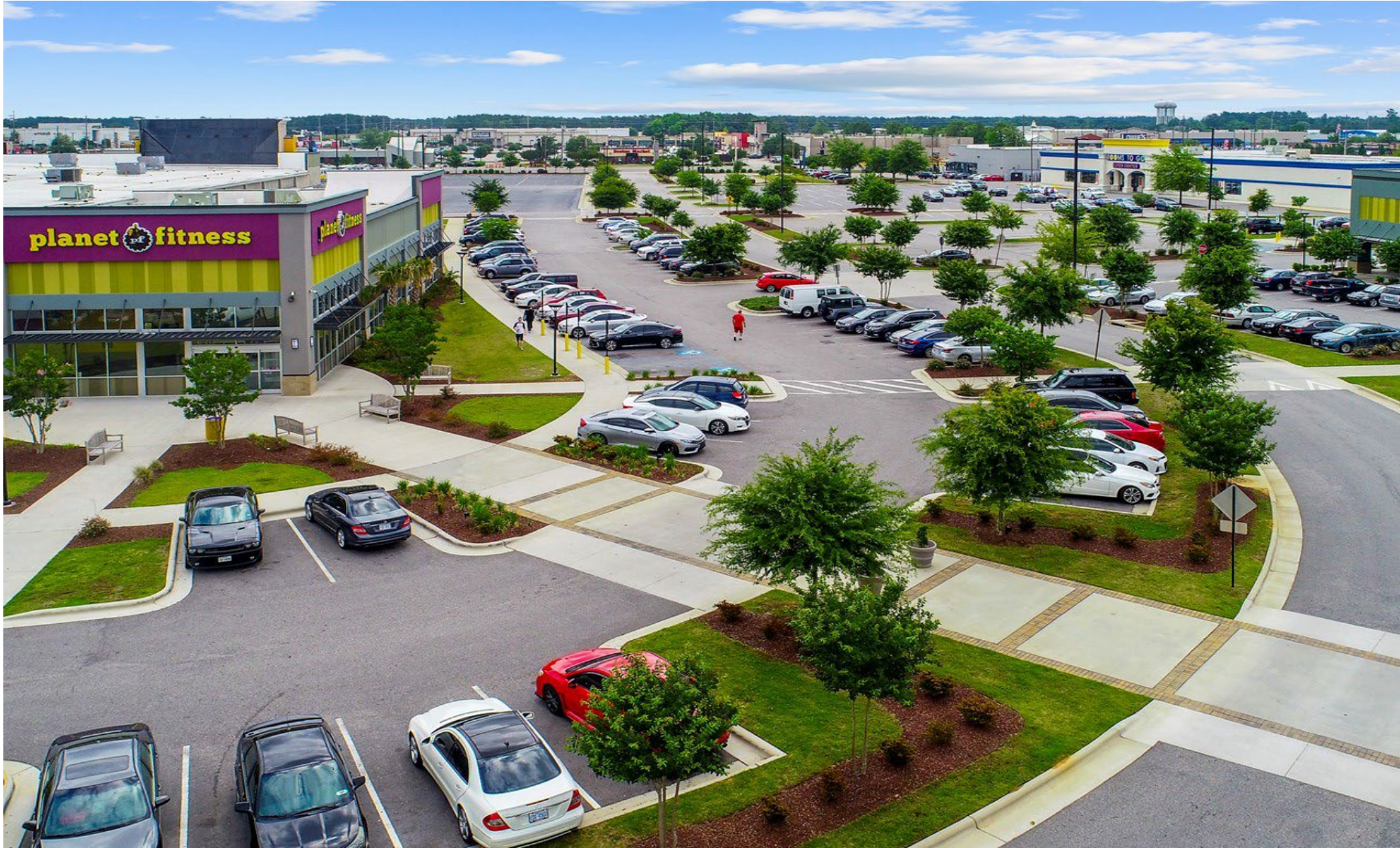
Marketfair Mall Fayetteville, NC Role: Civil Engineering & Site Development