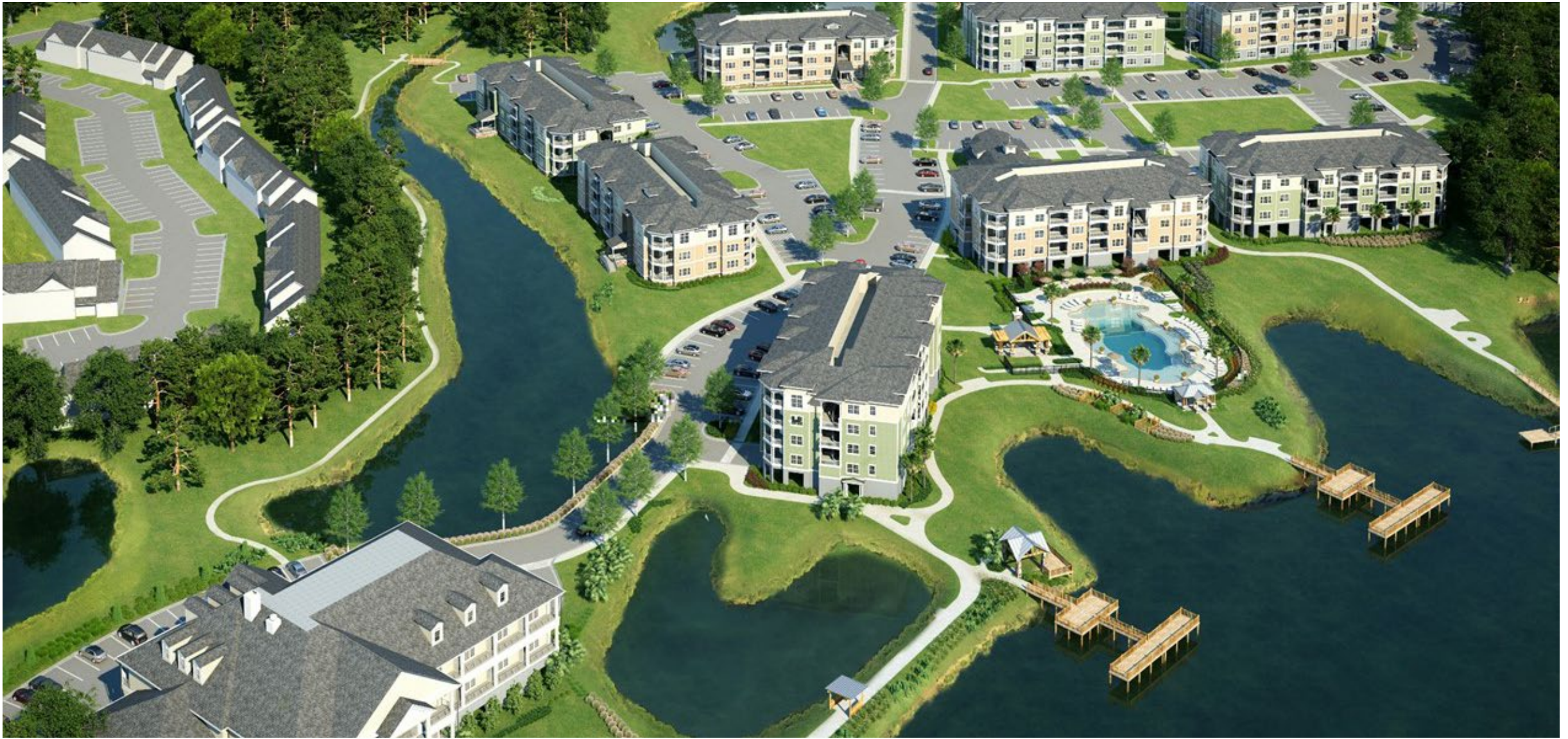
Sweetwater Apartments Charleston, SC Size: 320 units Role: Master Planning, Civil Engineering & Site Development