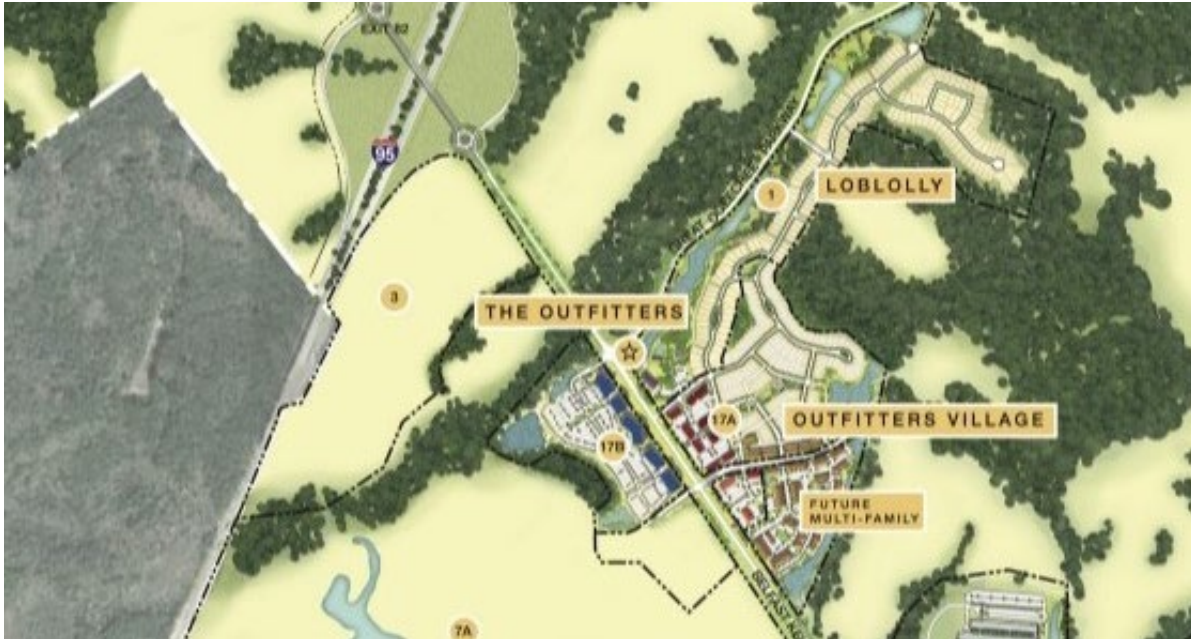
Heartwood at Richmond Hill A Raydient Places + Properties Community Richmond Hill, GA Size: 7,000-Acre PUD Role: PUD Development, Infrastructure Master Planning & Design