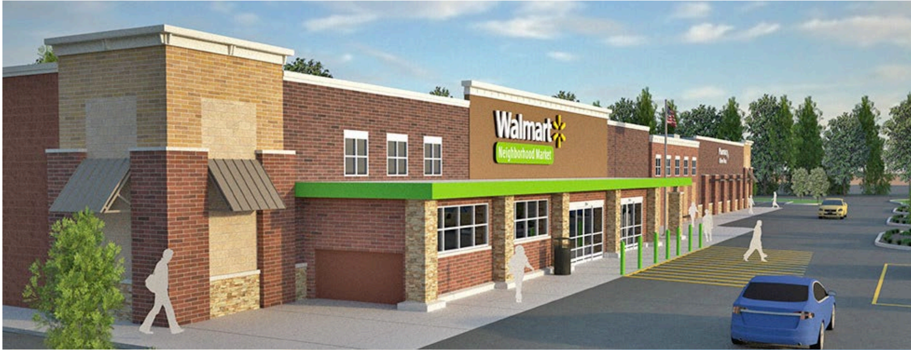
Walmart at Fort Mill Square Fort Mill, SC Role: Civil Engineering & Site Development