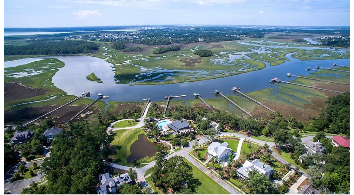
Belvedere Island Plantation Townsend, GA Size: 400 Acres Role: Civil Design Improvements