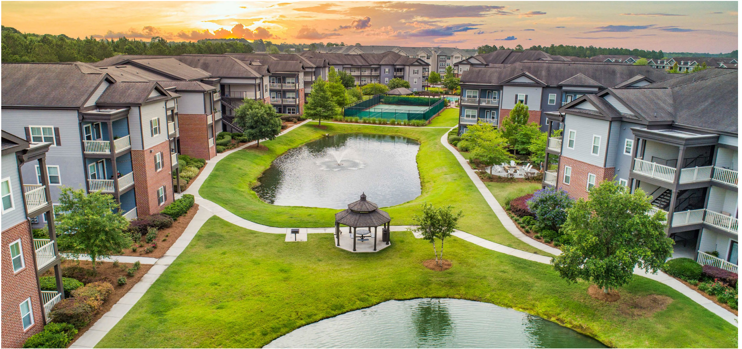
Avala at Savannah Quarters Pooler, GA Size: 256 units Role: Master Planning, Civil Engineering & Site Development