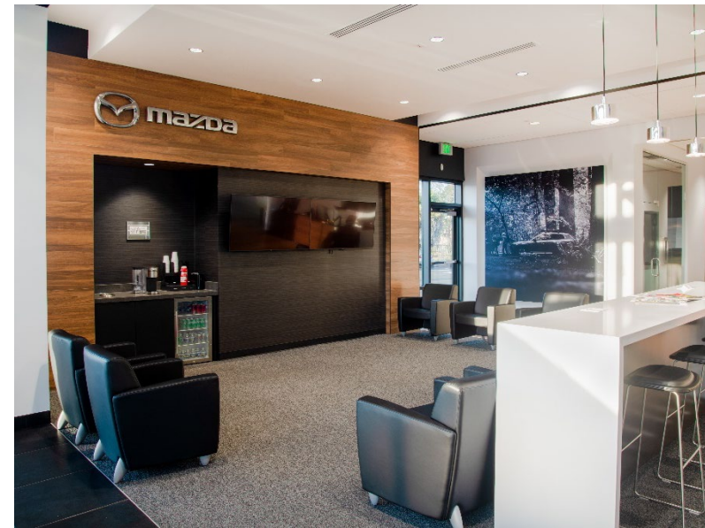
J.C. Lewis Mazda Dealership Savannah, GA Size: 2,900 SF Role: Architect & Engineer of Record