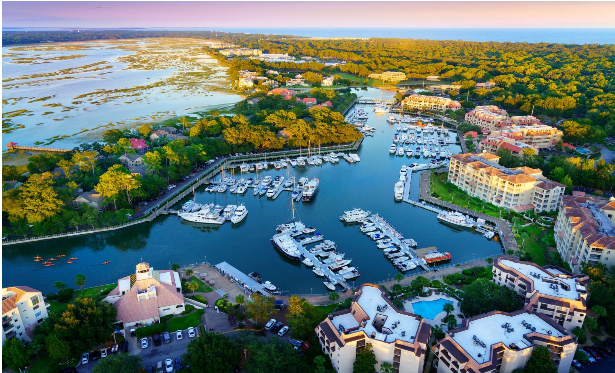
Shelter Cove Harbour & Marina Hilton Head Island, SC Size: 15.5 Acres Role: Master Planning, Civil Engineering & Site Development