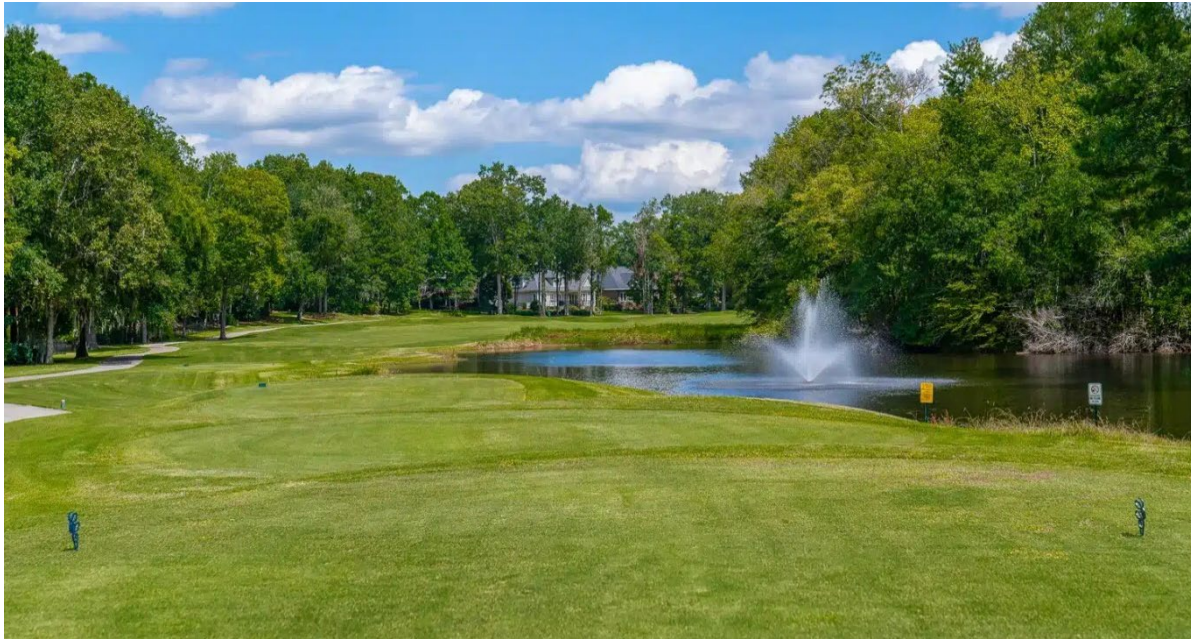
Coosaw Creek Country Club North Charleston, SC Size: 950 Acres Role: Master Planning, Civil Engineering & Site Development