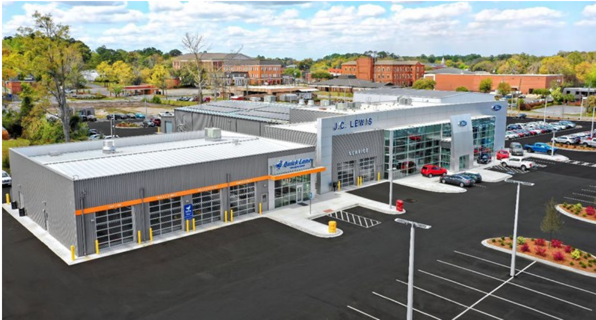
J.C. Lewis Ford Dealership & Service Center Hinesville, GA Size: 33,700 SF Role: Architect & Engineer of Record