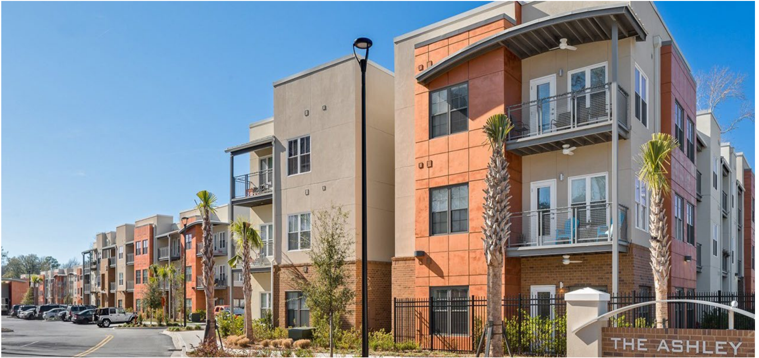
The Ashley Apartments Charleston, SC Size: 174 units Role: Master Planning, Civil Engineering & Site Development