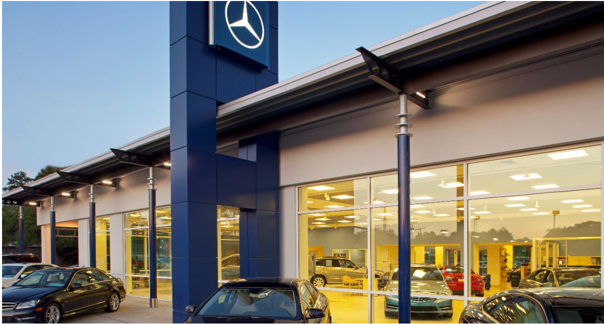
Critz Mercedes Benz Dealership Savannah, GA Size: 9,000 SF Role: Architect & Engineer of Record