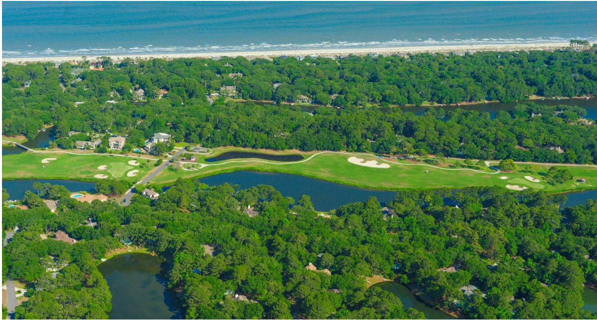
Palmetto Dunes Resort Hilton Head Island, SC Size: 2,000-Acre PUD Role: Master Planning, Civil Engineering & Site Development