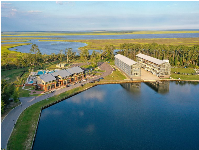
Waterways Township Bryan County, GA Size: 2,300-Acre PUD Role: Master Planning, Civil Engineering & Site Development