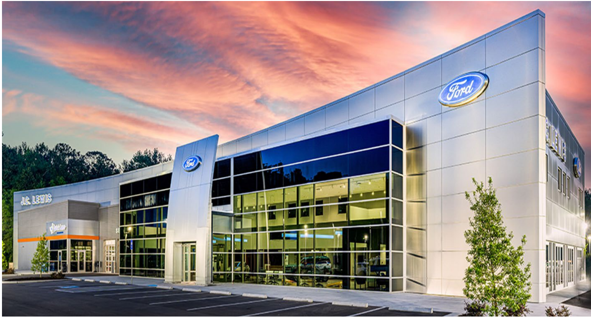
J.C. Lewis Ford Dealership & Quick Lane Service Center, Pooler, GA Size: 54,500 SF Role: Architect & Engineer of Record