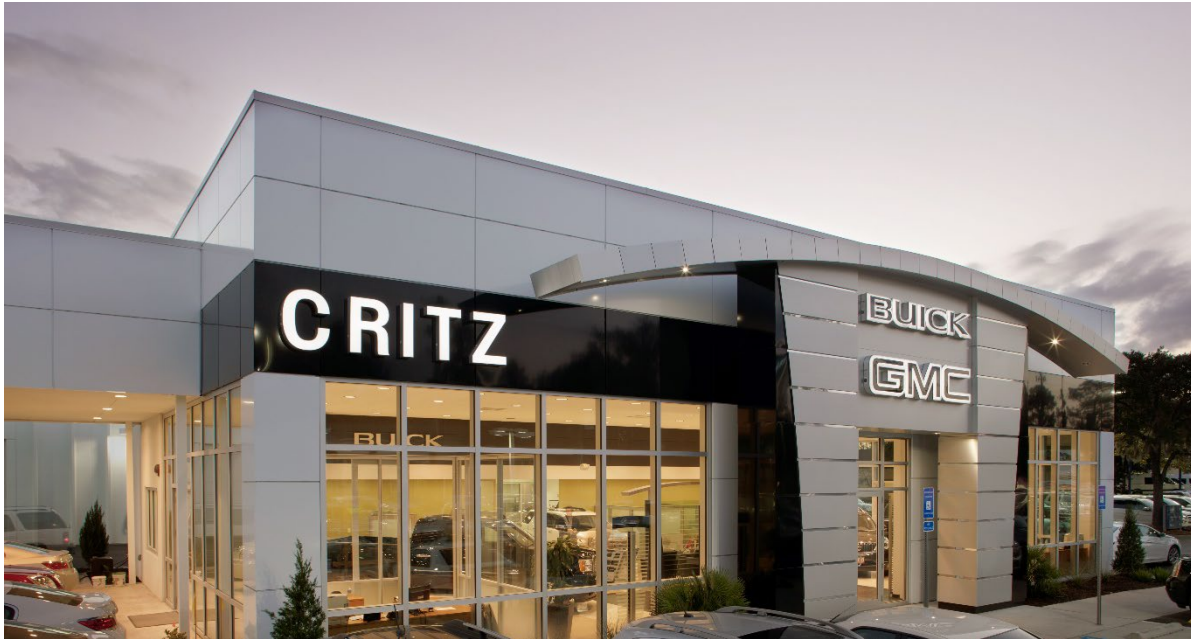
Critz Buick-GMC Dealership Savannah, GA Size: 4,500 SF Role: Architect & Engineer of Record