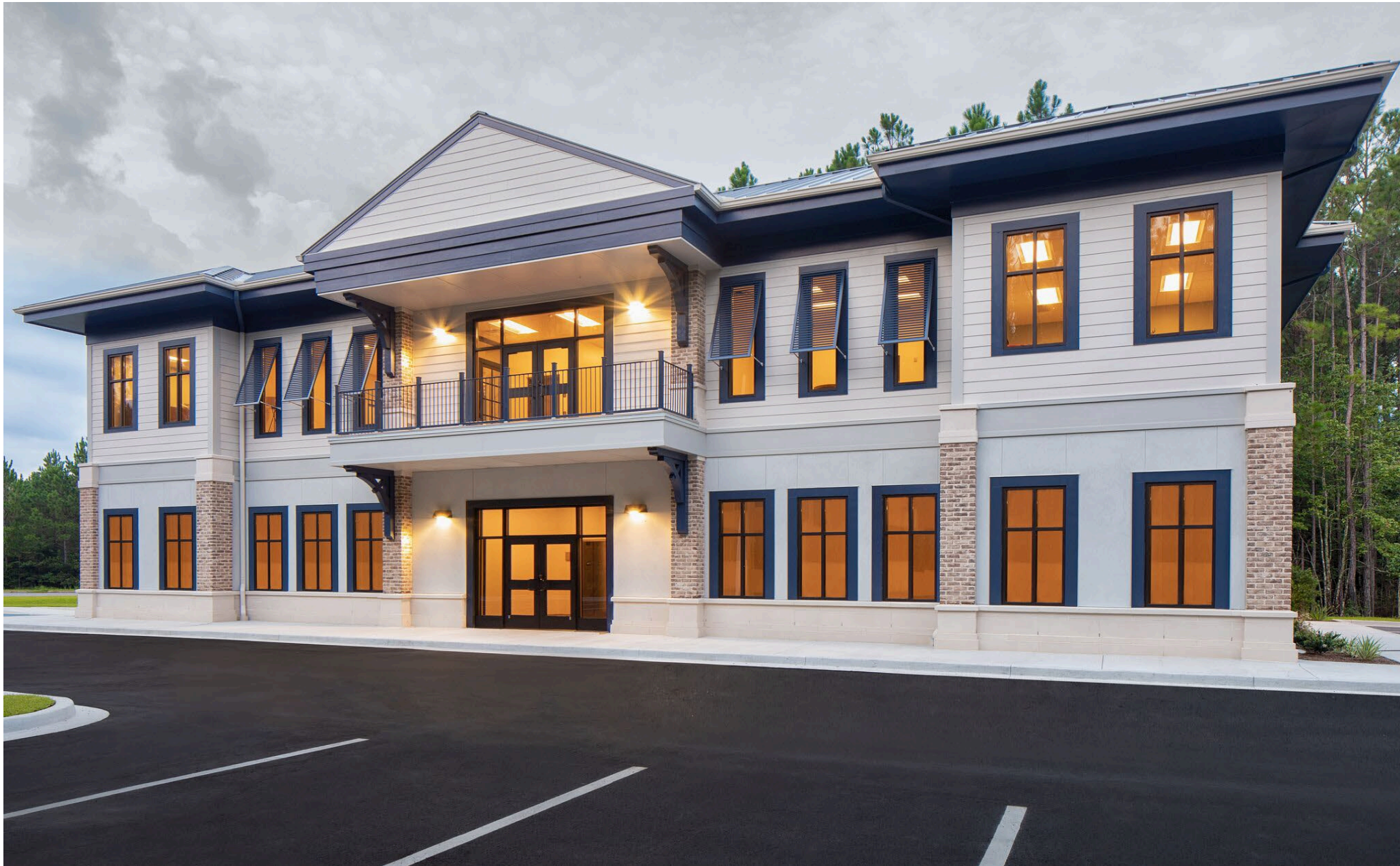
Barlow Office Building Pooler, GA Size: 10,000 SF Role: Architect & Engineer of Record