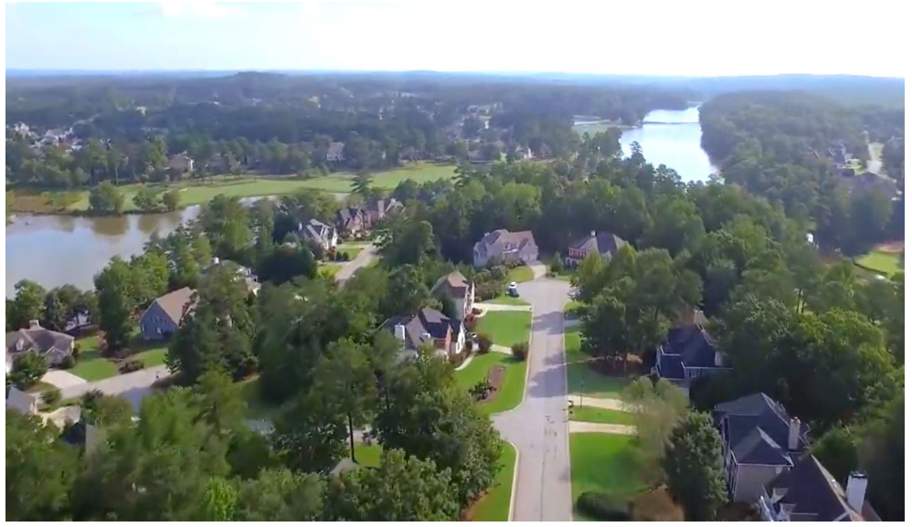
Mirror Lake Master Planned Community City of Villa Rica, GA Size: 1,000-Acre PUD Role: Master Planning, Civil Engineering & Site Development