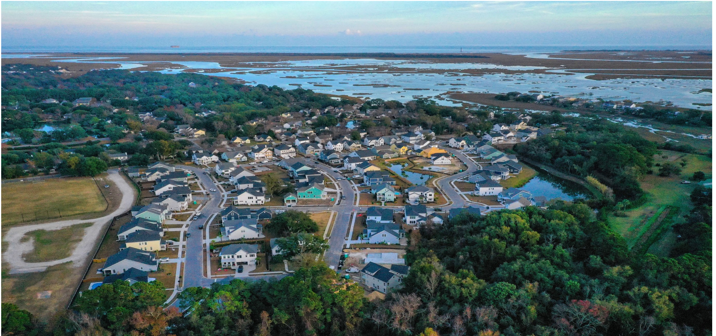
Bennett's Bluff Town of James Island, SC Size: 86-lots Role: Master Planning, Civil Engineering & Site Development