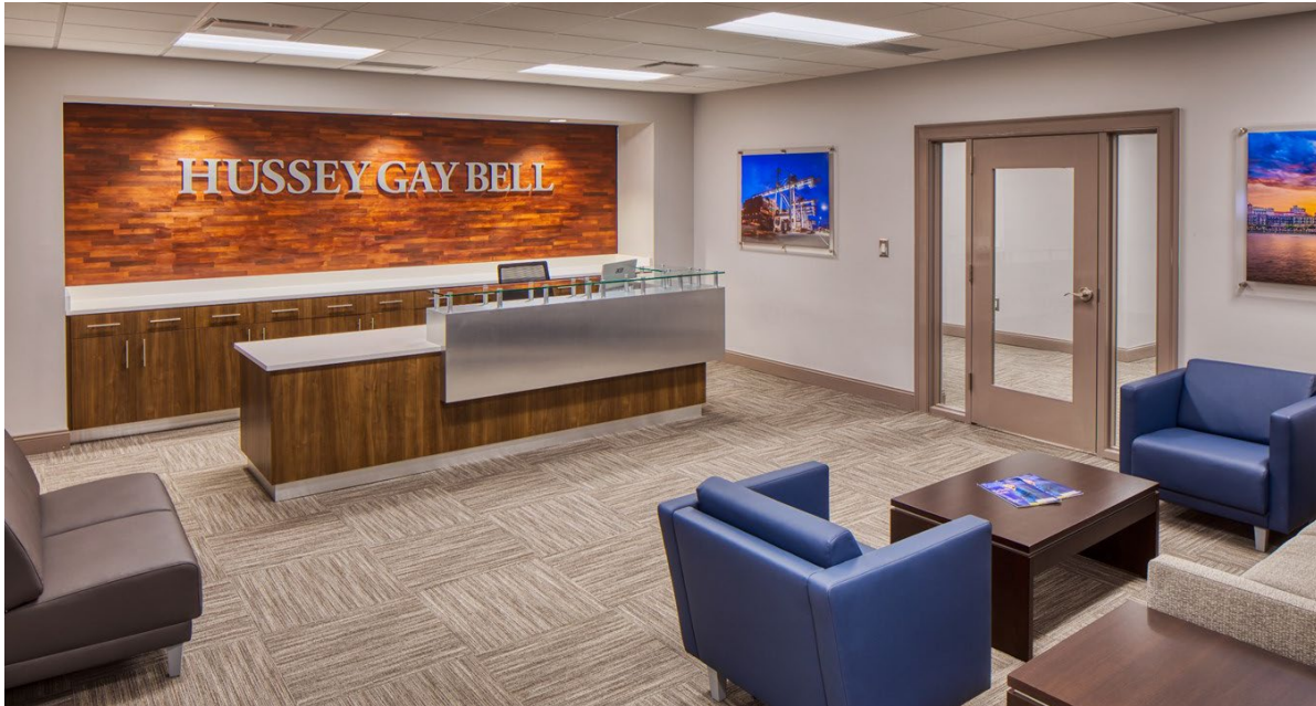
Hussey Gay Bell HQ Renovation Savannah, GA Size: 30,000 SF Role: Architect & Engineer of Record