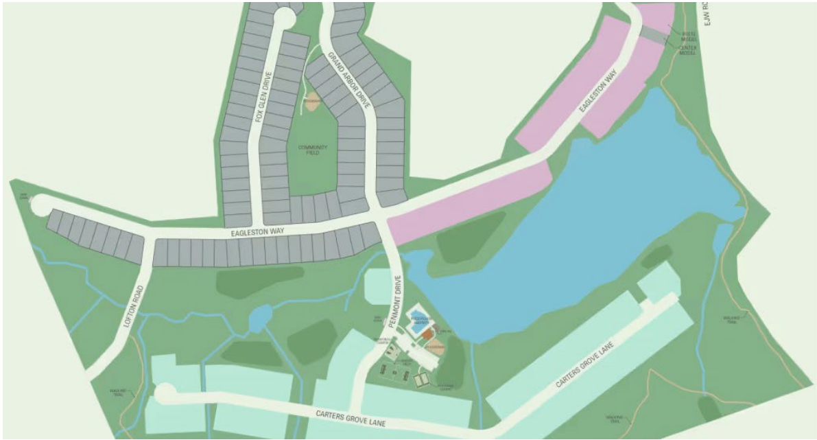
Grand Arbor Blythewood, SC Size: 90 Acres Role: Master Planning, Civil Engineering & Site Development