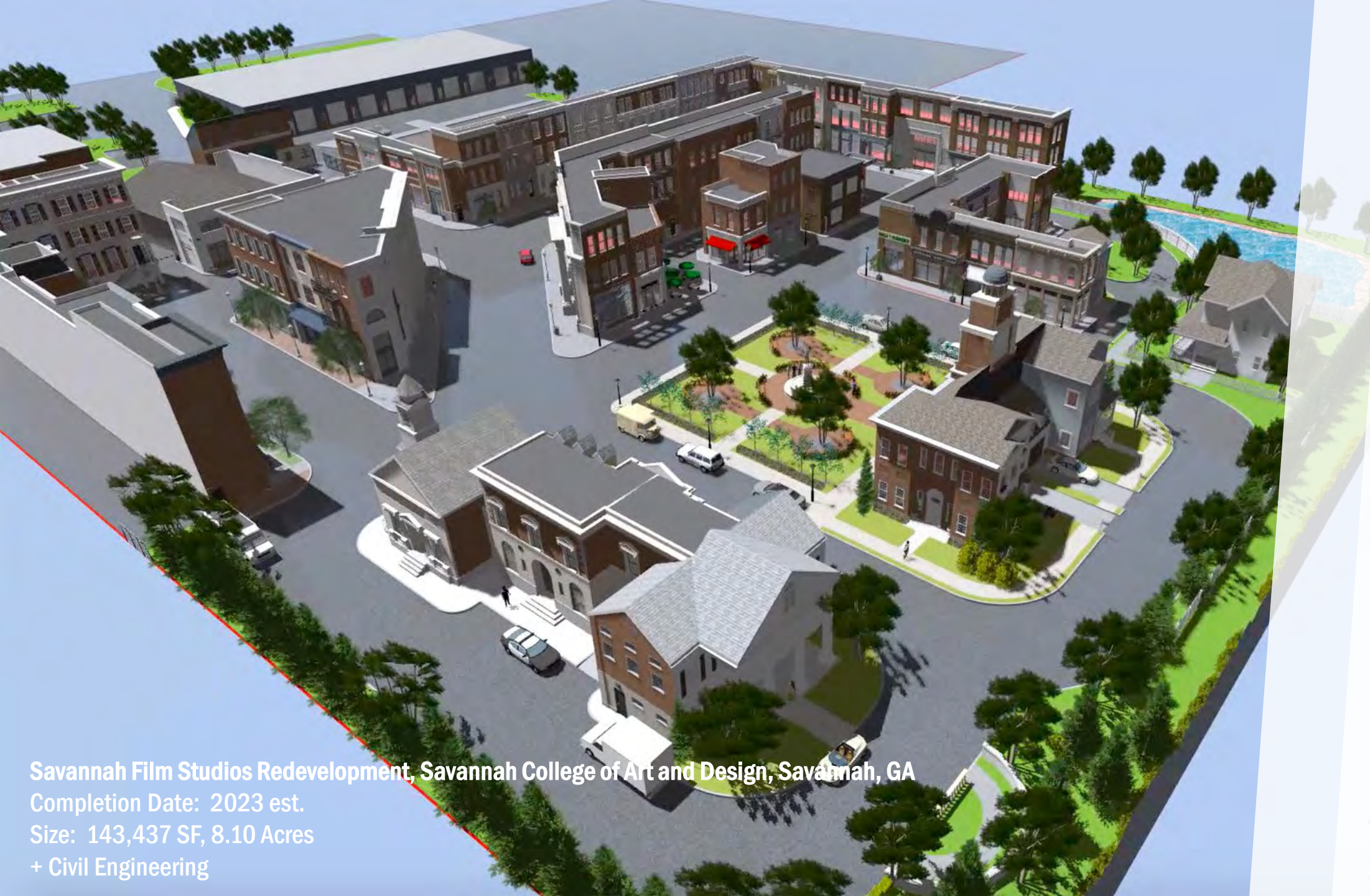
Savannah Film Studios Redevelopment, Savannah College of Art and Design, Savannah, GA Completion Date: 2023 est. Size: 143,437 SF, 8.10 Acres + Civil Engineering