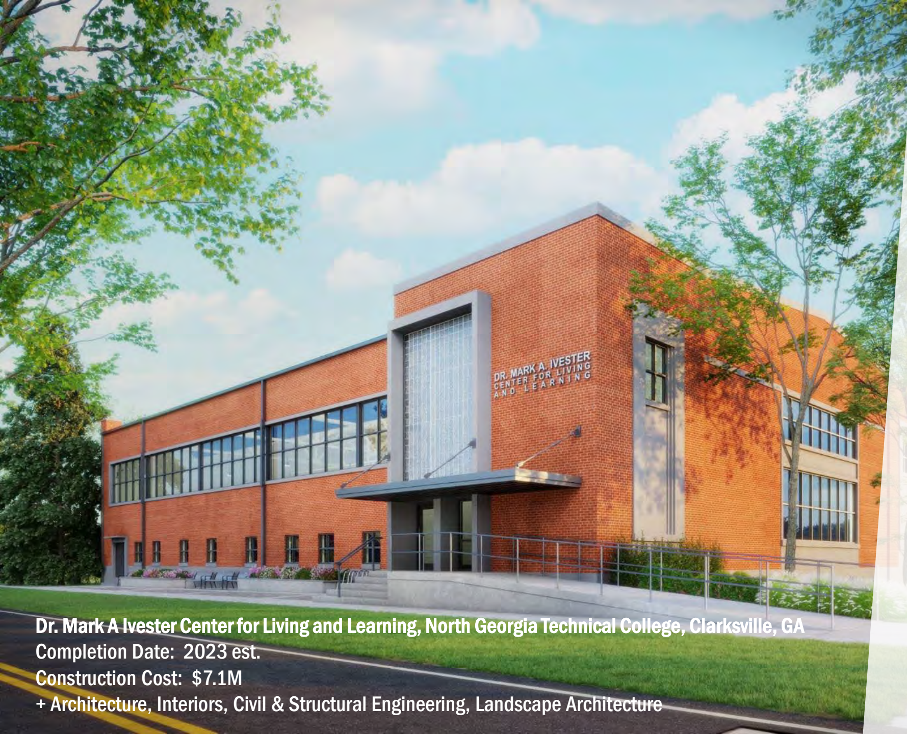
Dr. Mark A Ivester Center for Living and Learning, North Georgia Technical College, Clarksville, GA Completion Date: 2023 est. Construction Cost: $7.1M + Architecture, Interiors, Civil & Structural Engineering, Landscape Architecture